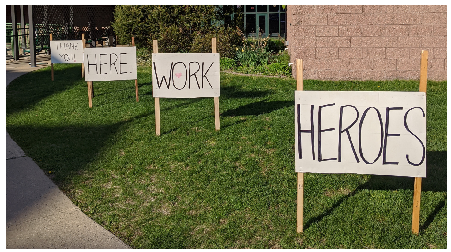
Thank you nurses - Neshaminy Manor nursing home.